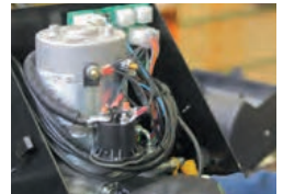
LOW NOISE POWER UNIT & NO ELECTRONICS = EASY MAINTENANCE