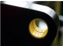
LOW MAINTENANCE BUSHES AND CHROMIUM PLATED PINS.