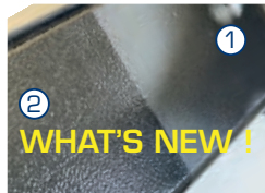
POWDER COATING PAINT (2) ADDED TO KTL PLUS (1). NO RUST AND NO SALT STAINS.