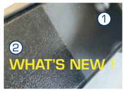
POWDER COATING PAINT (2) ADDED TO KTL PLUS (1). NO RUST AND NO SALT STAINS.