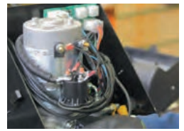
LOW NOISE POWER UNIT & NO ELECTRONICS = EASY MAINTENANCE