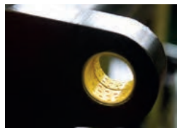
LOW MAINTENANCE BUSHES AND CHROMIUM PLATED PINS.